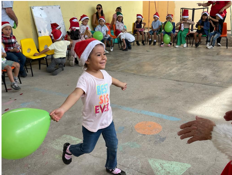
One by one, the children ran to meet Santa. Read More